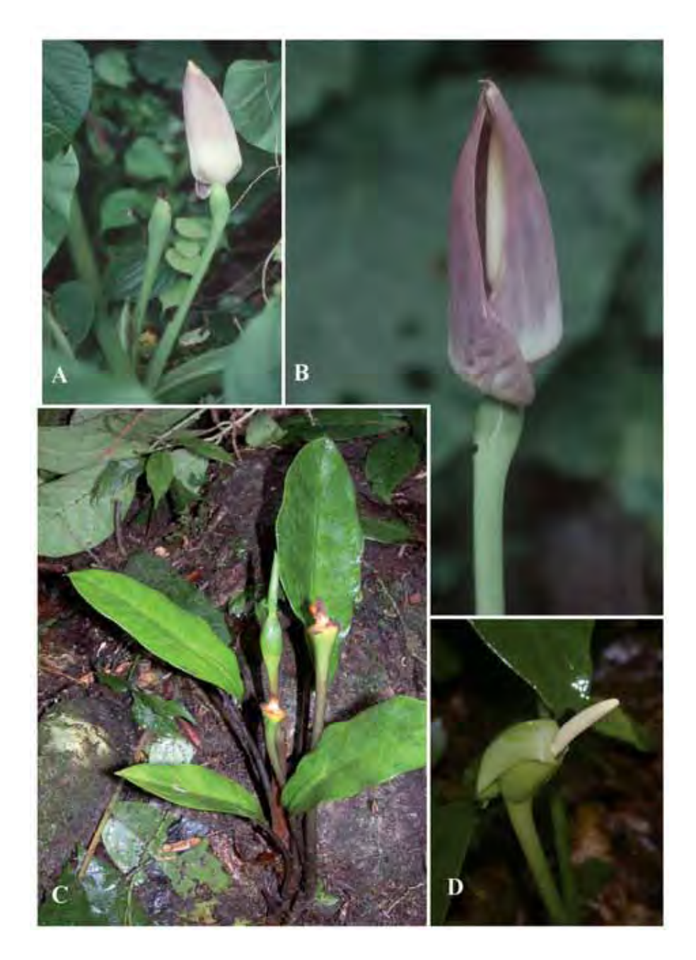
Figure 2. Alocasia hypnosa : A. Inflorescence, side view; B. Inflorescence front view. Alocasia perakensis : C. Whole plant in early fruit with one emerging new inflorescence; D. Inflorescence at male anthesis.